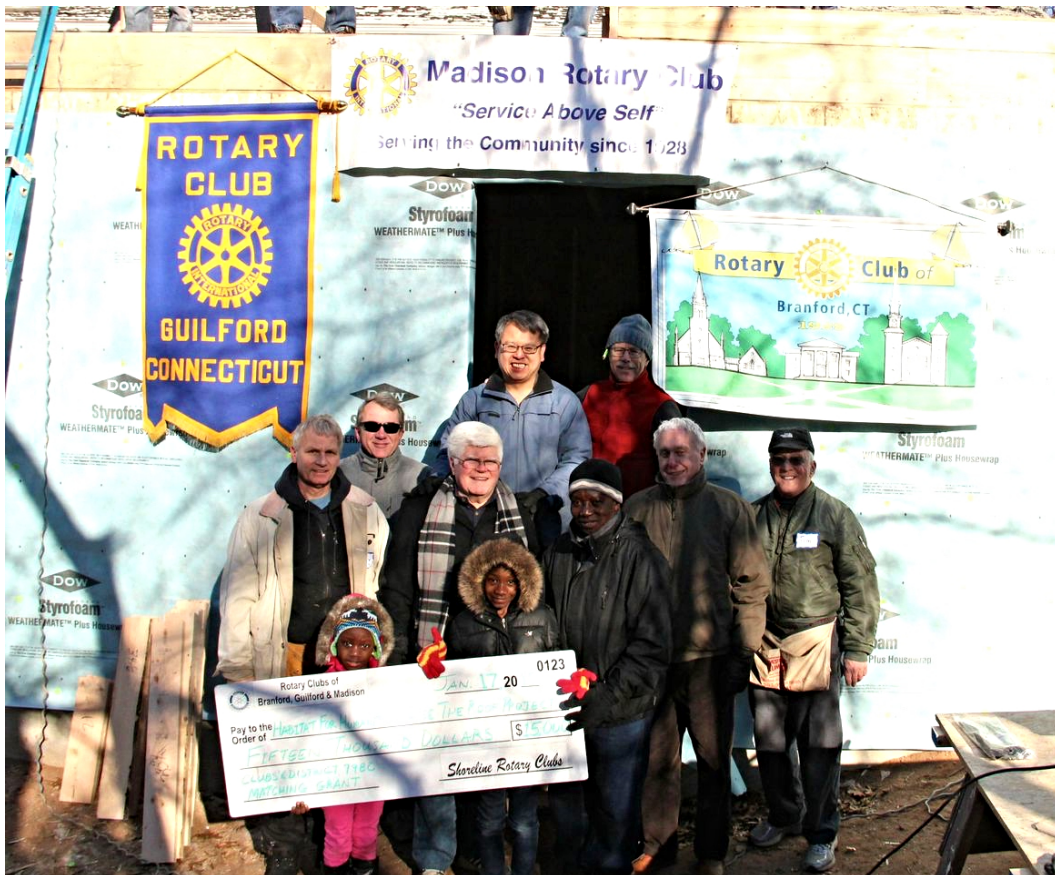
On January 17, Raise the Roof celebrated the groundbreaking of our eleventh Habitat for Humanity build at 603 Sherman Parkway in New Haven. This was